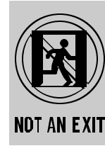
SMS24 NOT AN EXIT (w/ pictogram)