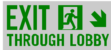
SMS22 EXIT THROUGH LOBBY (w/ pictogram)