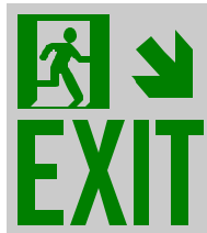
SMS21 EXIT-R ARROW