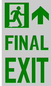
SMS20 FINAL EXIT (w/ pictogram)