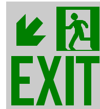
SMS25 EXIT-L ARROW