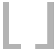
SMS28 SMS29 8" x 3" x 1"